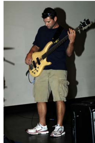
One of the "Homeland Howlers"